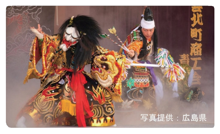
(Kagura, Hiroshima's traditional performing art)

We offer a traditional performing art unique to Hiroshima or Japan such as Kagura for your gala dinner. Please contact our foundation in advance for information on past services provided and to discuss any specific requests.